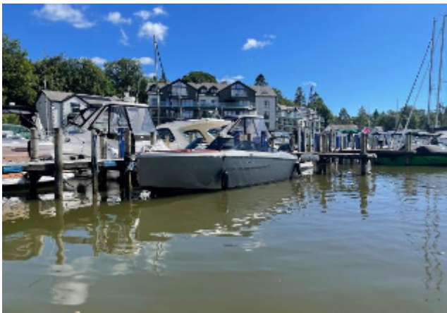
Cranchi E26 Rider For Sale