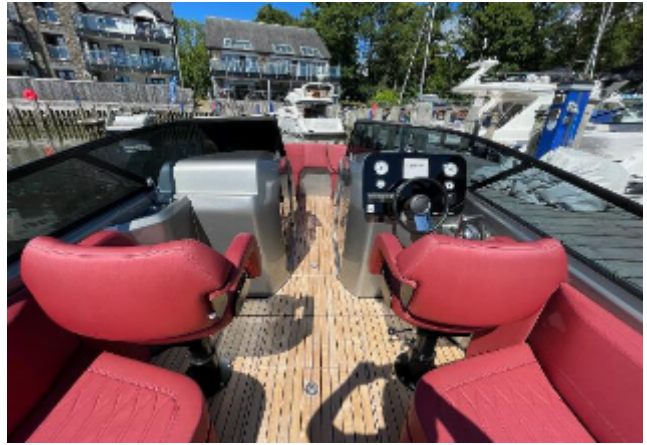
Cranchi E26 Rider For Sale