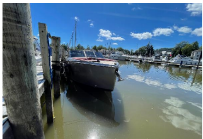
Cranchi E26 Rider For Sale