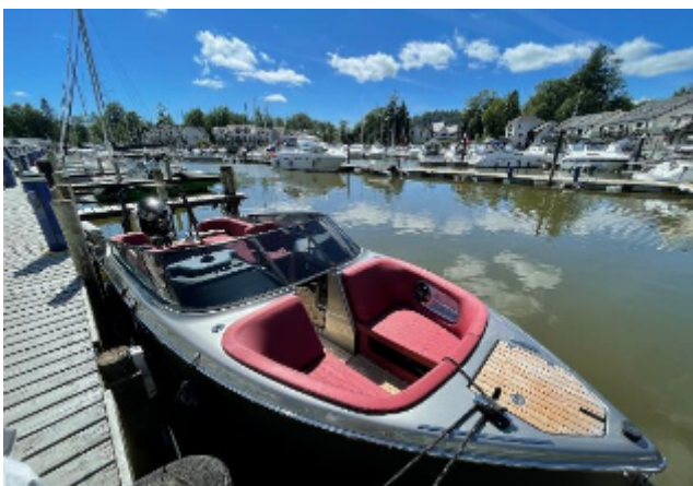
Cranchi E26 Rider For Sale