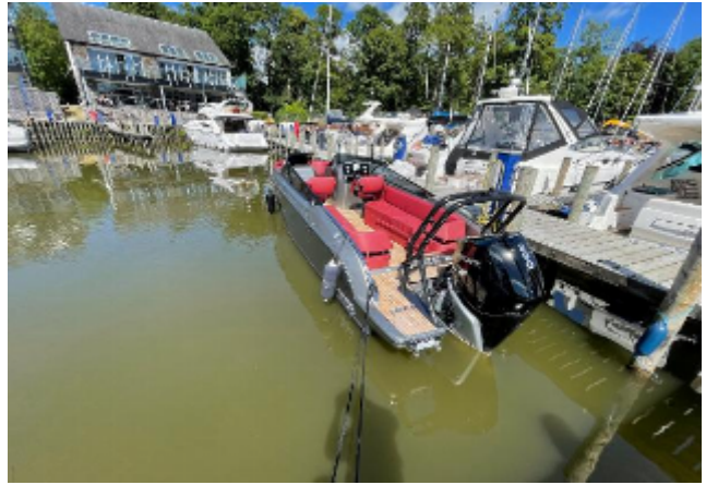
Cranchi E26 Rider For Sale