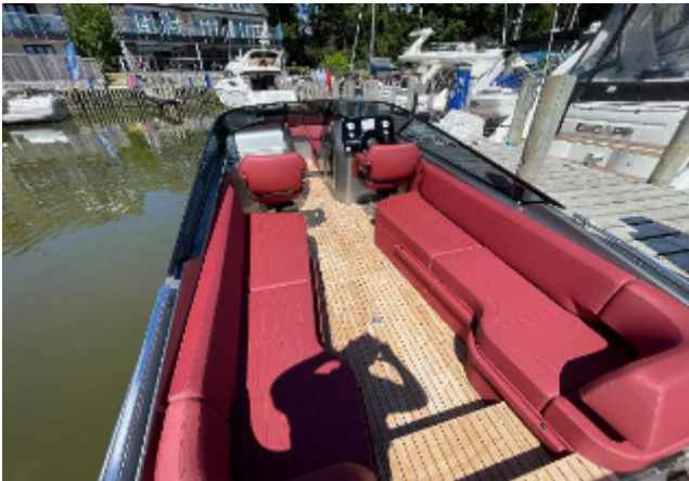
Cranchi E26 Rider For Sale