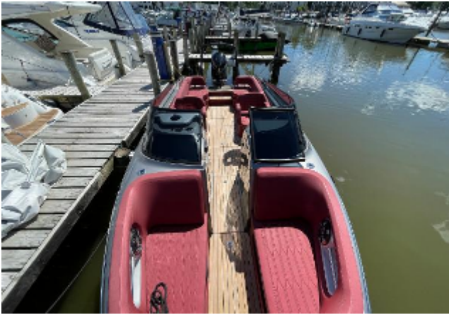
Cranchi E26 Rider For Sale