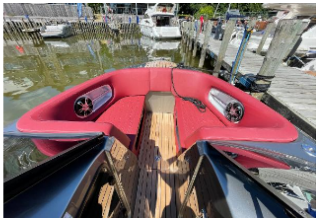
Cranchi E26 Rider For Sale