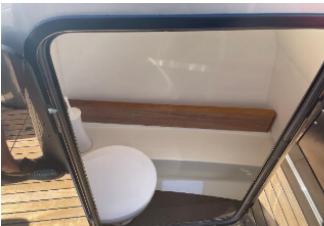
Cranchi E26 Rider For Sale