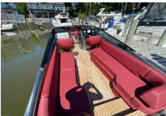
Cranchi E26 Rider For Sale