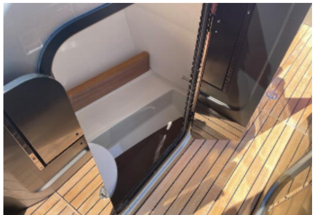
Cranchi E26 Rider For Sale