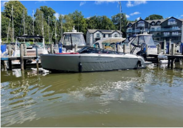
Cranchi E26 Rider For Sale