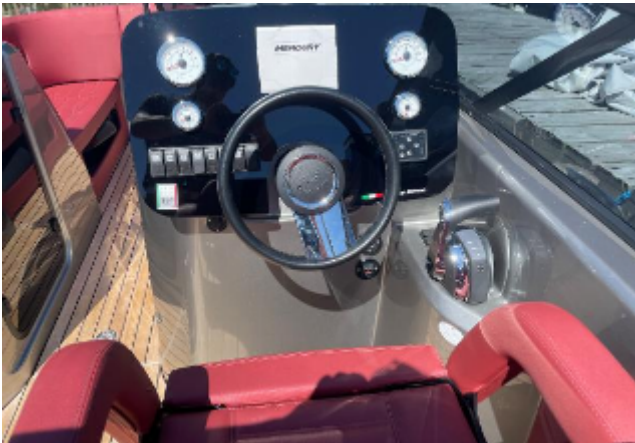
Cranchi E26 Rider For Sale