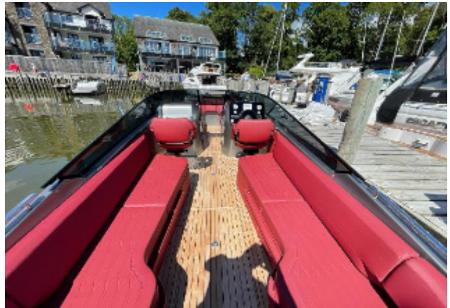
Cranchi E26 Rider For Sale