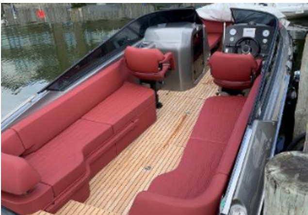
Cranchi E26 Rider For Sale