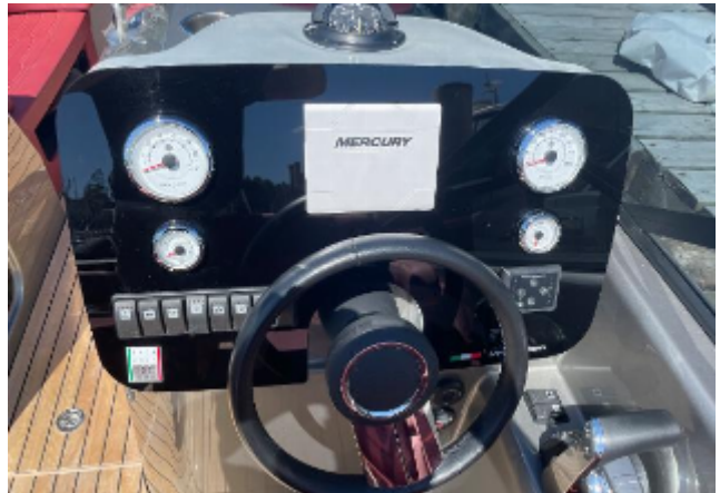
Cranchi E26 Rider For Sale