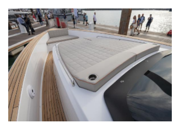
Pardo 43 For Sale