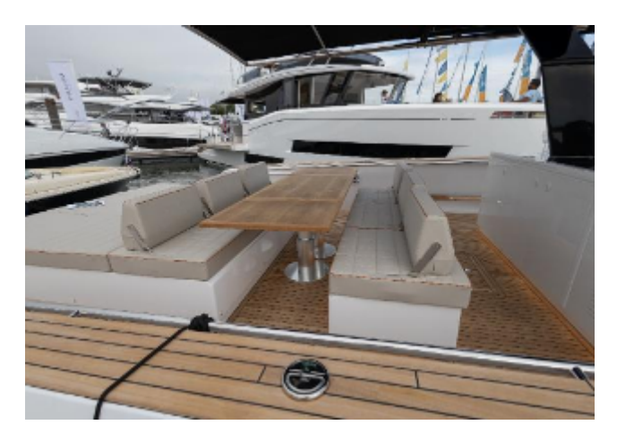
Pardo 43 For Sale