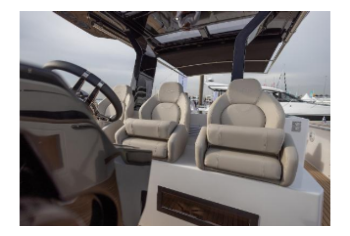
Pardo 43 For Sale