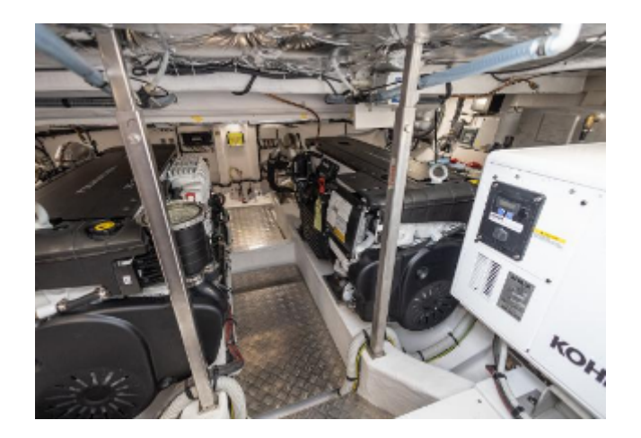
Pardo 43 For Sale