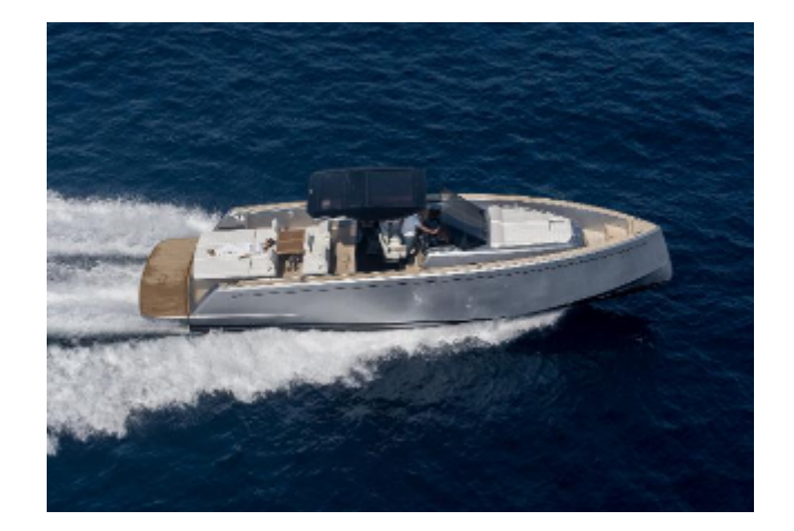
Pardo 43 For Sale - Brochure Image