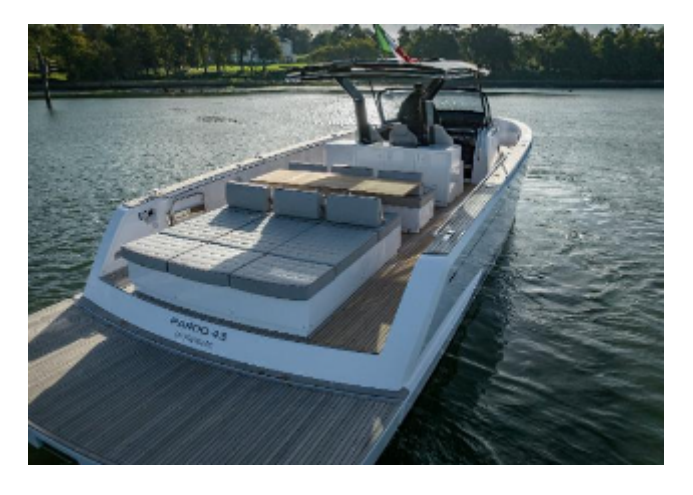
Pardo 43 For Sale