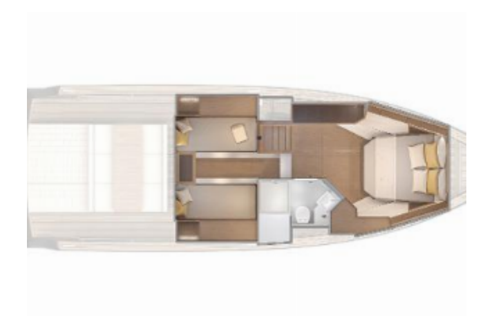
Pardo 43 For Sale Layout