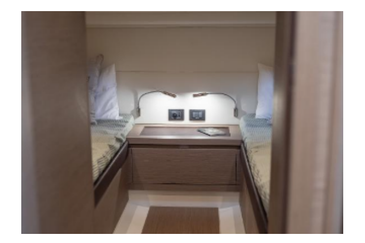
Pardo 43 For Sale