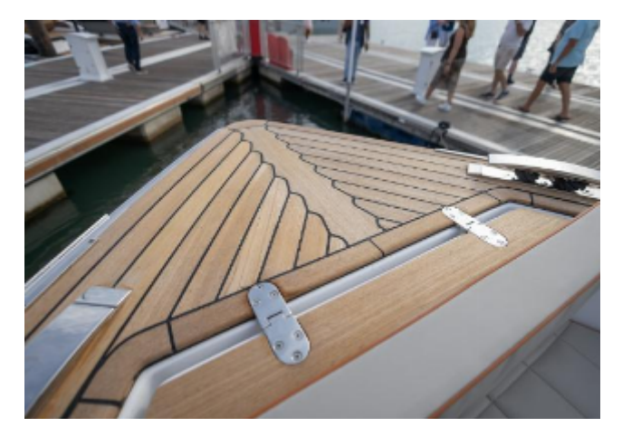
Pardo 43 For Sale