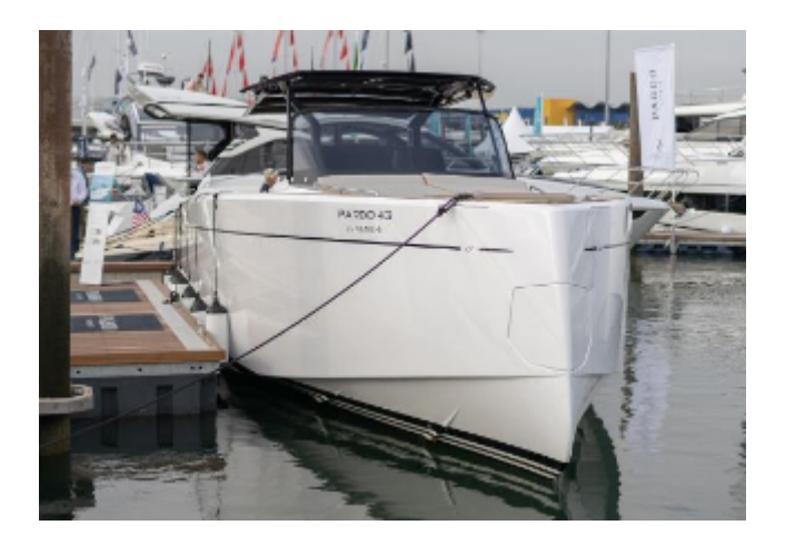
Pardo 43 For Sale