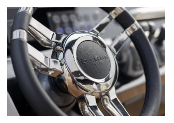
Pardo 43 For Sale