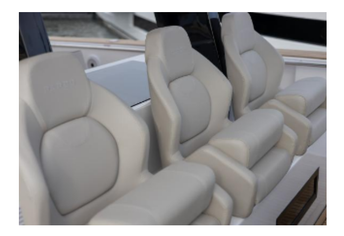
Pardo 43 For Sale