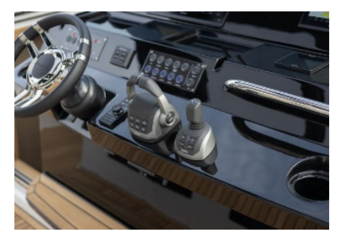
Pardo 43 For Sale