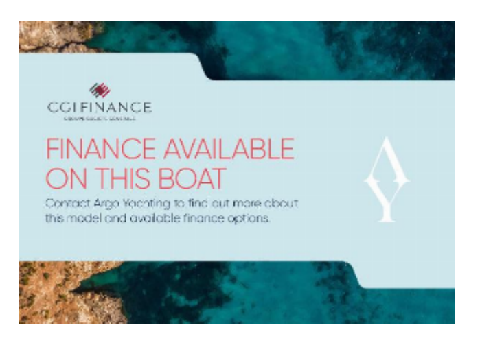
Argo Yachting Finance