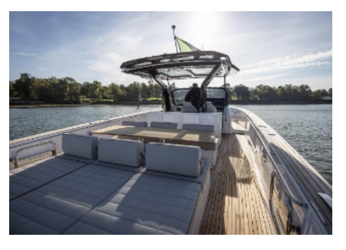
Pardo 43 For Sale