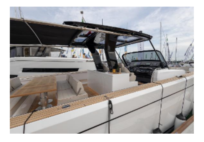
Pardo 43 For Sale