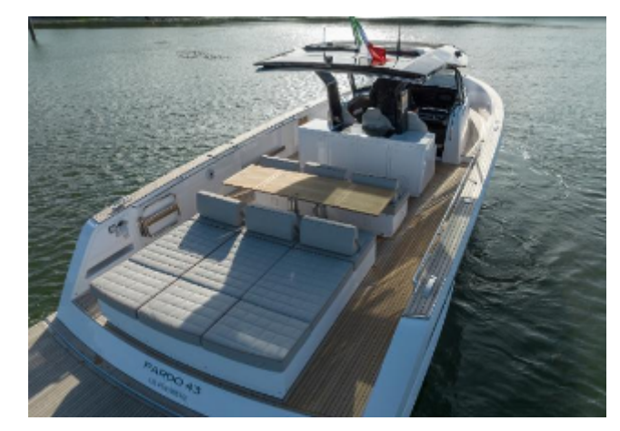
Pardo 43 For Sale