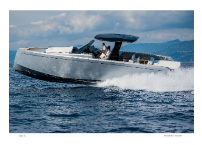
Pardo 43 For Sale - Brochure Image