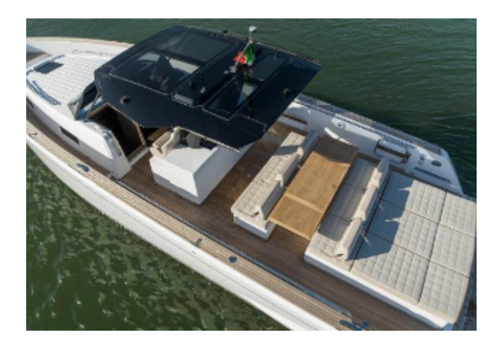
Pardo 43 For Sale