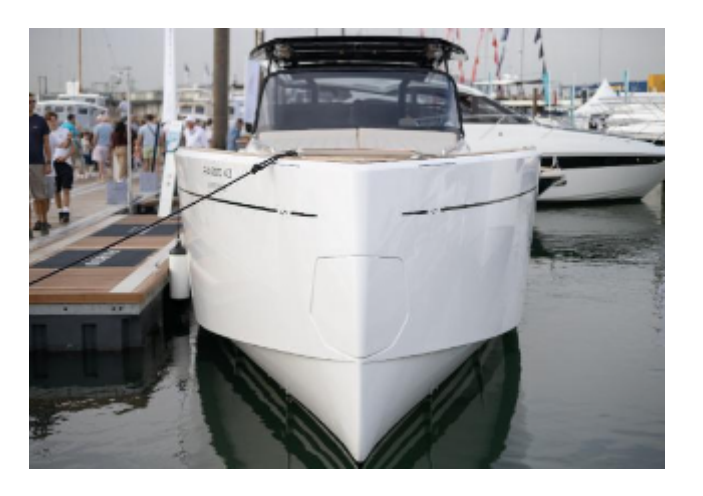
Pardo 43 For Sale