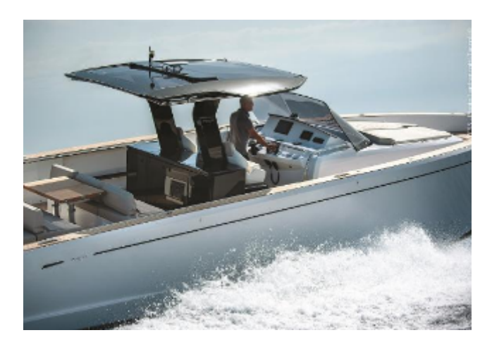
Pardo 43 For Sale - Brochure Image