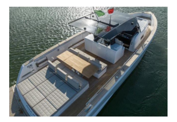
Pardo 43 For Sale