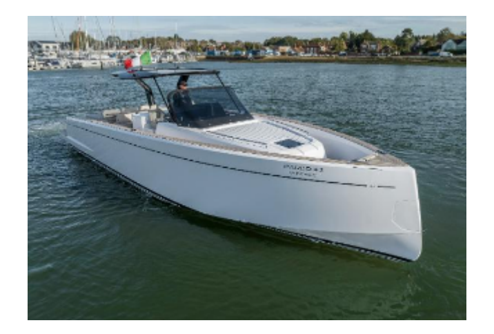
Pardo 43 For Sale