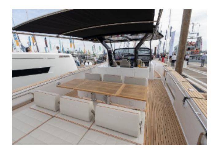
Pardo 43 For Sale