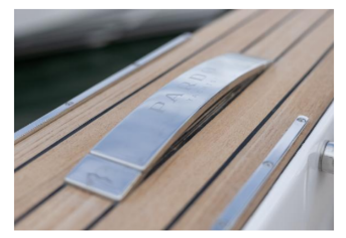
Pardo 43 For Sale