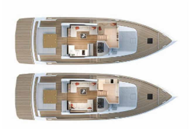
Pardo Yachts GT52 For Sale - Layout