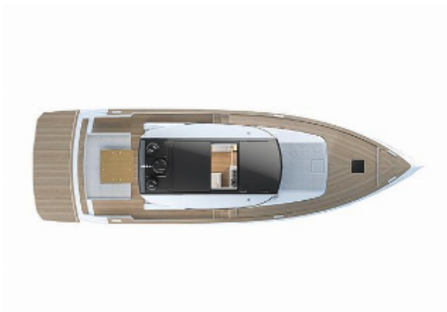
Pardo Yachts GT52 For Sale - Layout