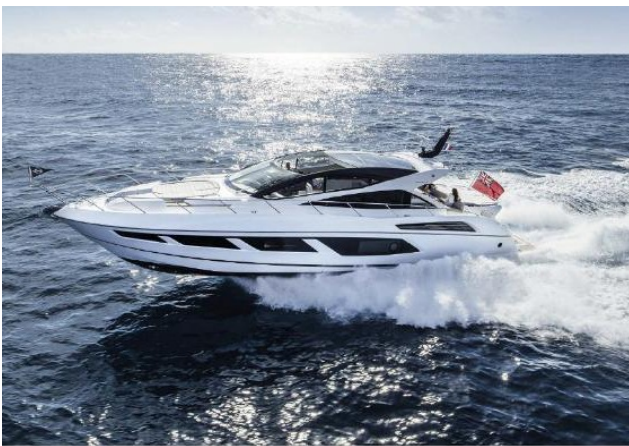
Sunseeker Predator 68 - Sister Ship