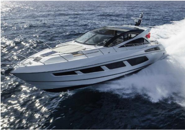
Sunseeker Predator 68 - Sister Ship