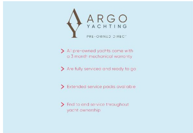
Argo Yachting Promises