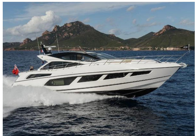
Sunseeker Predator 68 - Sister Ship