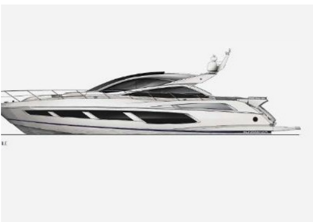
Sunseeker Predator 68 - Profile