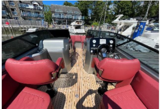
Cranchi E26 Rider For Sale