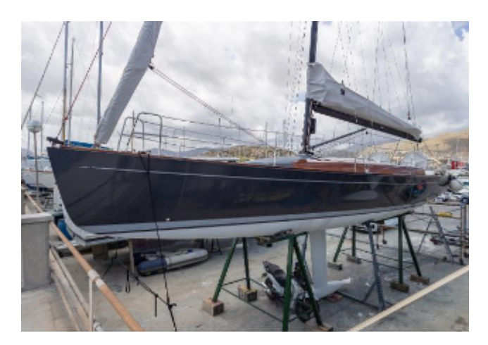
Tofinou 12 For Sale