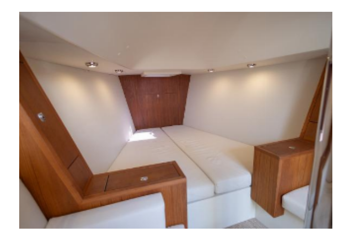
Tofinou 12 For Sale