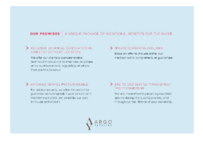
Argo Yachting Promises