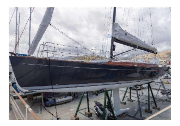
Tofinou 12 For Sale