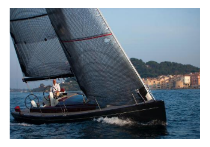
Tofinou 12