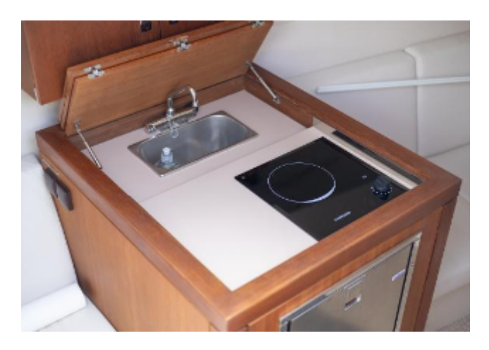
Tofinou 12 For Sale