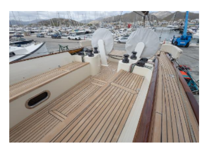
Tofinou 12 For Sale