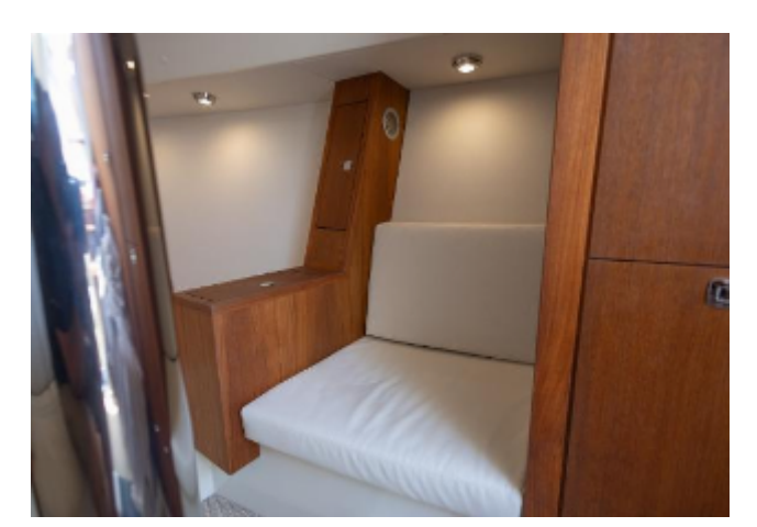
Tofinou 12 For Sale