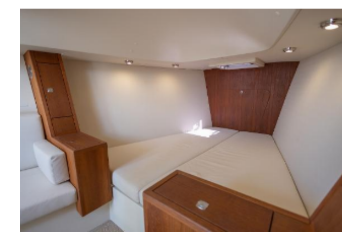
Tofinou 12 For Sale