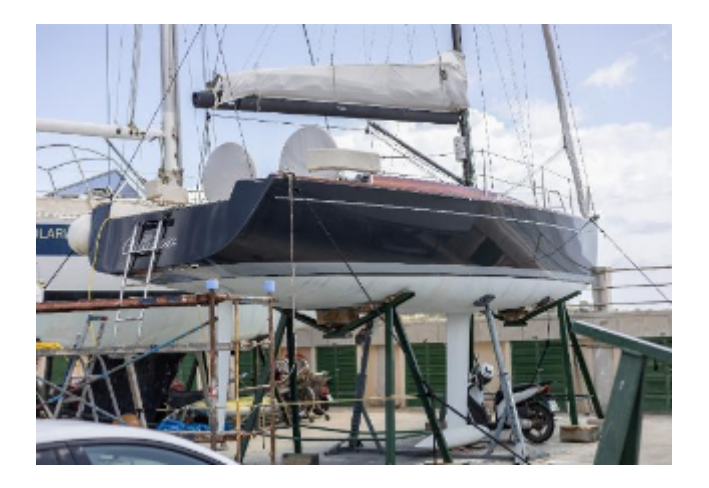
Tofinou 12 For Sale