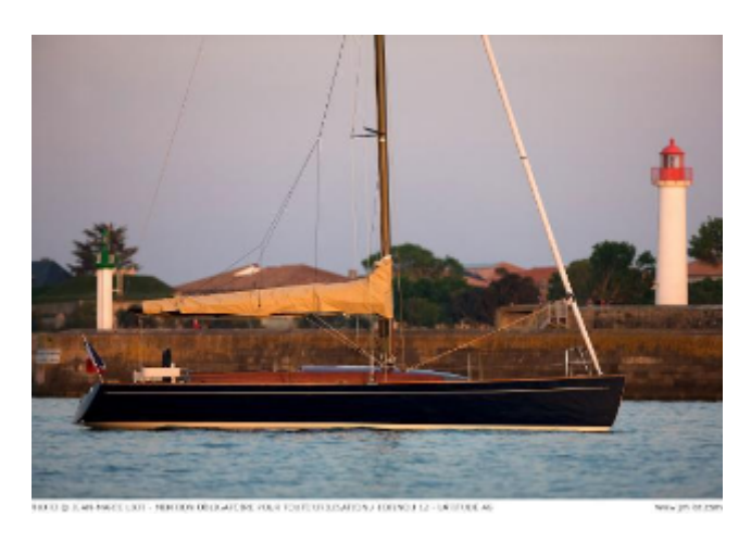
Tofinou 12