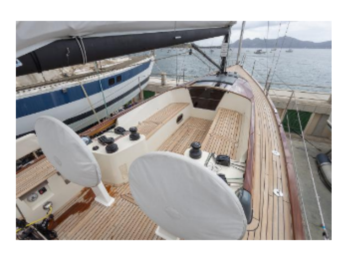
Tofinou 12 For Sale