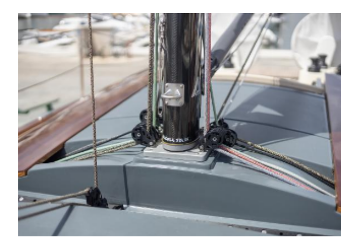
Tofinou 12 For Sale