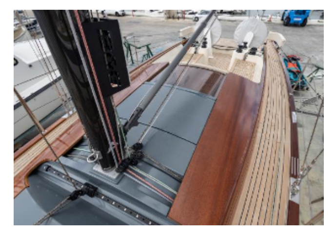
Tofinou 12 For Sale