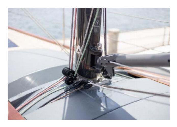
Tofinou 12 For Sale