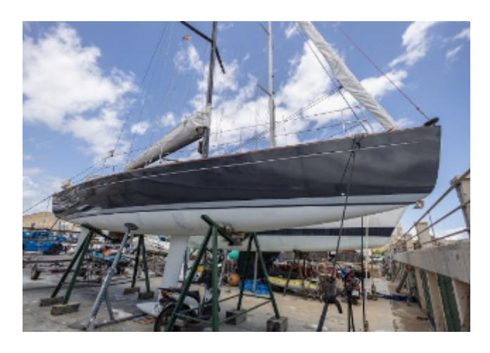
Tofinou 12 For Sale