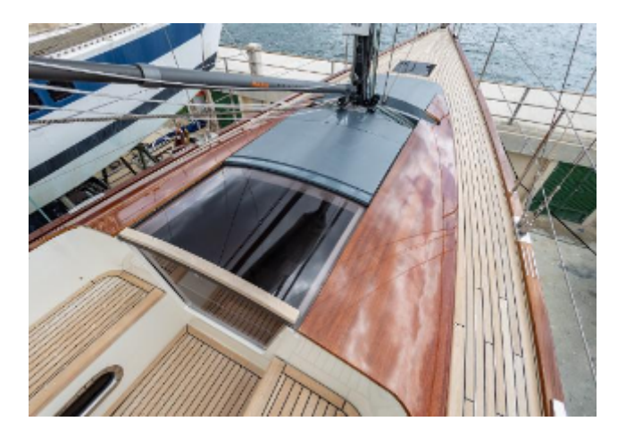
Tofinou 12 For Sale