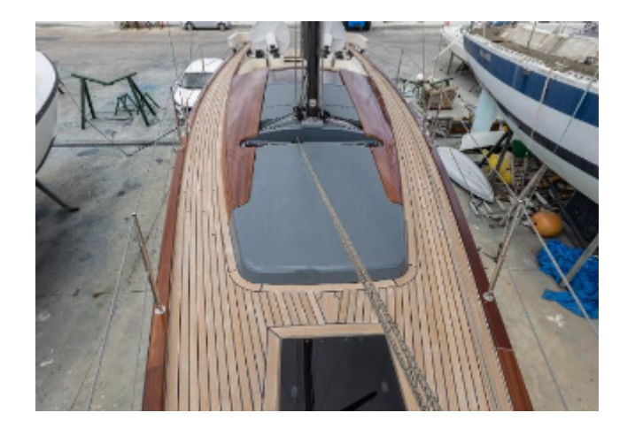
Tofinou 12 For Sale