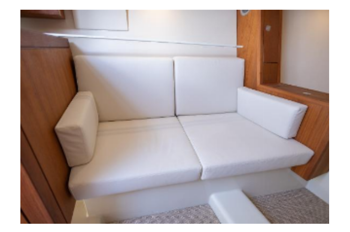
Tofinou 12 For Sale