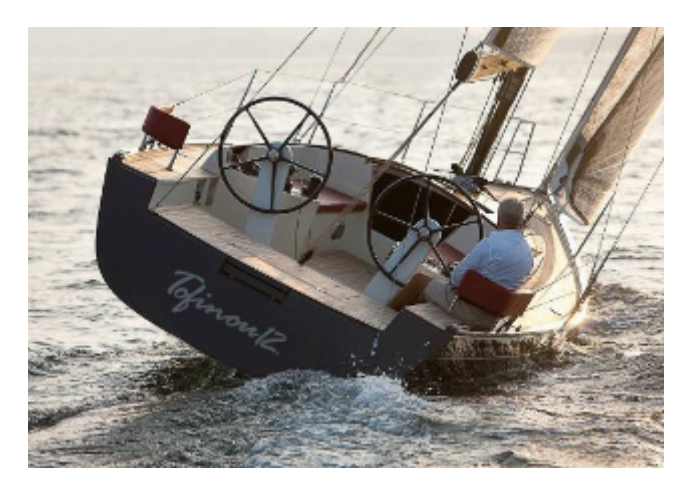
Tofinou 12