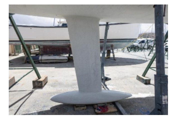
Tofinou 12 For Sale