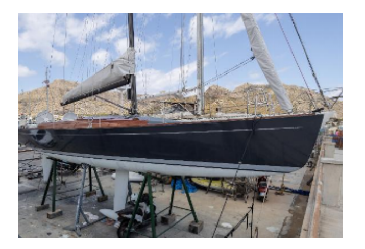
Tofinou 12 For Sale