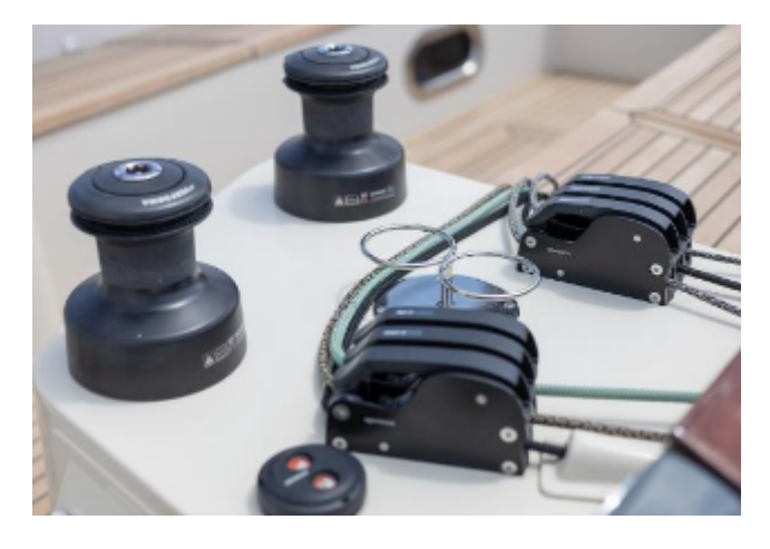
Tofinou 12 For Sale