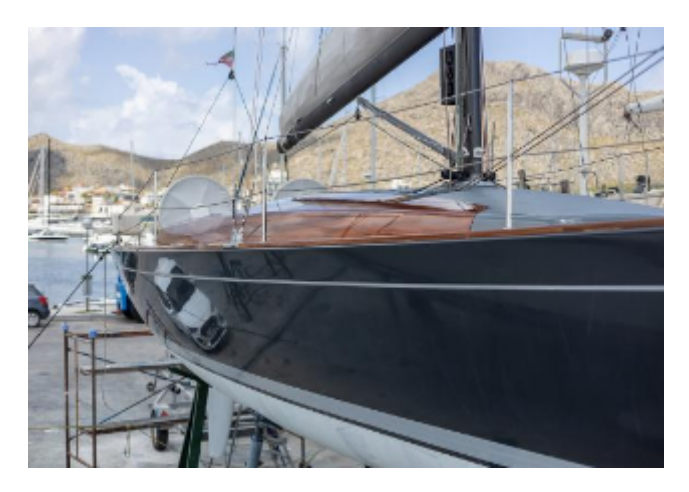
Tofinou 12 For Sale